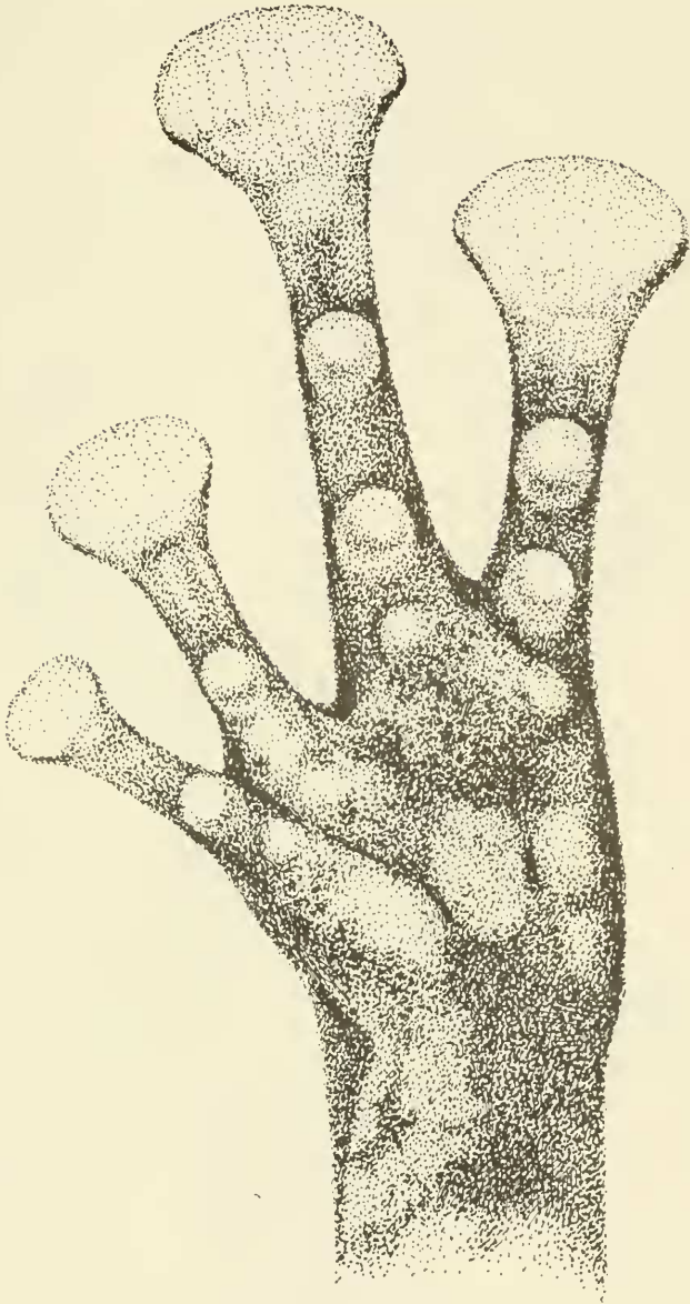
FIGURE 1. Platymantis lawtoni , inferior view of hand.